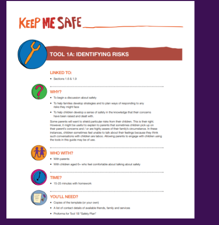
Click on the page icon above to access the activity.

Use this this activity to help the child, young person and their family identify what they are worried about, thinking or feeling now.